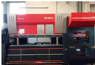
HD 1003 Amada