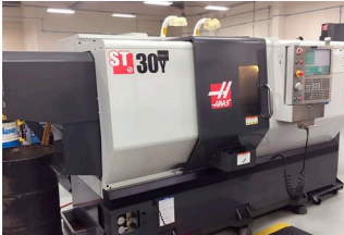
MORI SEIKI DURA VERTICAL 5100