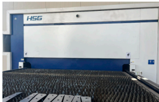
HSG: G6025H 20,000W